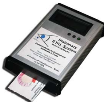
QuantTab™ Determination Card Used with the EYAL™ DD-06L-C Reader